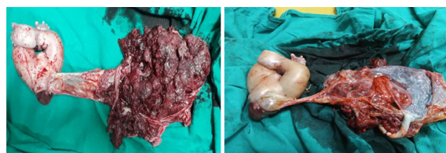
Fig. 2: Acardiac acephalus twin with absent umbilical cord

APGAR score of the newborn was 9 and 10 at 1 and 5 minutes, respectively. Twin B was acardiac and weighed 270grams with placental membranes directly attached to the umbilical area (umbilical cord was absent). Only lower limbs & lower part of abdomen were developed. External genitals were also poorly developed. On examination, placenta was diamniotic monochorionic and weighed 390g rams. Histopathology examination showed a monochorionic diamniotic placenta. Sections examined from umbilical cord, showed presence of three vessels ; and section examined from the membranes showed chorion & amnion with focal lymphocytic infiltration & fibrin deposition. Twin A was under intensive care for 26 days and the screening tests for congenital anomalies were negative.