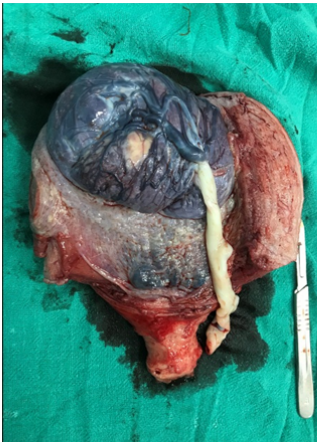
Fig. 4: Cut section of uterus showing adherent placenta at fundocornual end

1: 8000 to 1:15,000 deliveries. The major risk factors for spontaneous uterine rupture are congenital uterine anomalies, intrauterine infection, placenta percreta or cornal pregnancy.