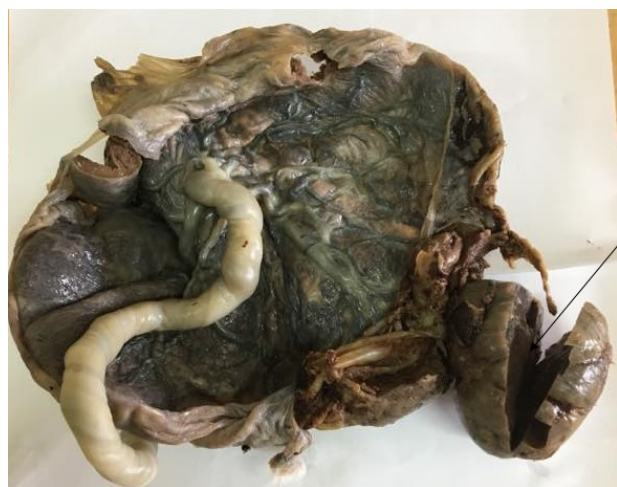
Fig. 1: Placenta and the cut chorioangioma