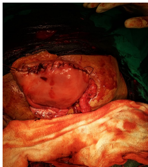
Fig. 2: Showing uterus after repair of uterine rent

On examination, pulse rate was 140/min. and BP was 100/60 mm Hg. General condition of patient was average. Patient was pale and dehydrated. On per abdominal examination, it was distended and tender, with guarding and rigidity. Uterine contour could not be made out. On local examination, head was lying outside. Turtle neck sign present. Patient was already catheterized, urine was haemorrhagic and was only in tubings. Clinical diagnosis of rupture uterus was made and patient was taken up for laparotomy. Patient was given general anaesthesia. Abdomen was opened vertically, haemoperitoneum of 700ml. Fetal body and limbs along with the placenta was lying in the abdominal cavity and head was in uterus. Baby of 2.34 kg was extracted as breech. A linear rupture of around 10-12 centimeter was present at fundo-posterior region as shown in Figure 1. Uterus was repaired in 3 layers and bilateral tubal ligation was done. Abdomen closed in layers. Intraoperatively, 2 PCV and 2FFP and postoperatively 2 PRP were transfused. There was