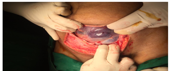
Fig. 2: Intra operative picture