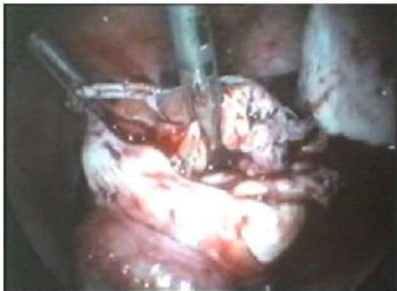
Completion of stripping upto hilus