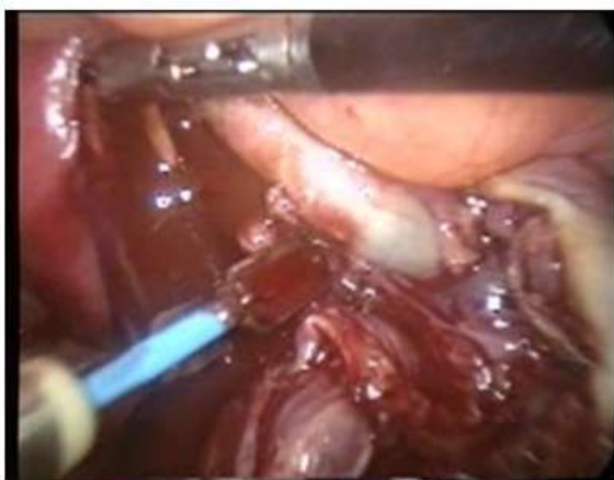
Bipolar coagulation & cutting at hilus