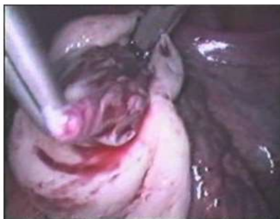
Direct stripping at original adhesion site

Twenty three patients were being investigated for infertility, of which 2 patients (8.7%) conceived spontaneously. The first was at four months follow up, in group 2 followed by stripping at the hilus. The second patient underwent stripping at the original adhesion site followed by coagulation and cutting.