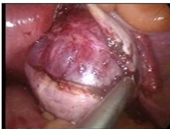
Excision of circular rim of tissue at original adhesion site