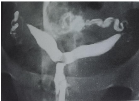
Fig. 1: Bicornuate uterus on HSG

The results of each procedure, HSG, TVS, and DHL were compared with each other. The results are analysed with percentages and proportion