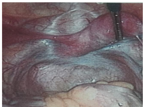
Fig. 3: Unicornuate uterus on laparoscopy