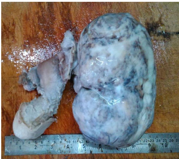
Gross specimen showing uterus & cervix with normal appearing right fallopian tube & ovary with left sided ovarian mass

The lady was then taken up for staging laparotomy after control of hypertension in view of ovarian tumour. On laparotomy, a left sided ovarian mass of about 15*12*7 cm was noted. Total abdominal hysterectomy with bilateral salpingo-oophorectomy was done. Uterus was atrophic with cervical elongation, and weighing about 100 gms. Right sided tube and ovary appeared atrophic. Left sided ovarian mass weighed 1 kg. All other intraabdominal organs appeared normal.