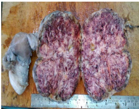
Gross appearance of the cut section of ovarian

Histopathological examination revealed the mass being ovarian fibroma.