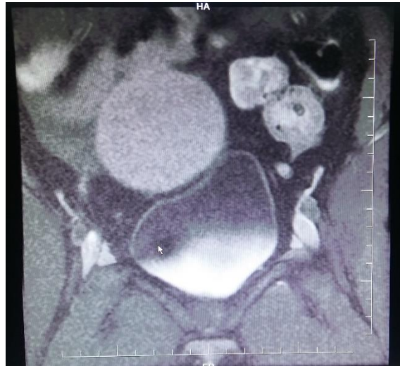
Fig. 1: CECT - dumb-bell lesion with central constriction in the Left adnexa adjacent to Left ovary

testosterone fell significantly after 1 week of surgery and she is doing well on follow up.