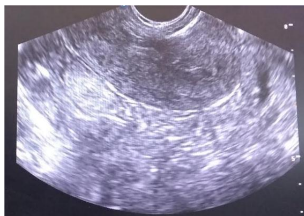
Fig. 5: Ultrasound showing empty uterus on day 39