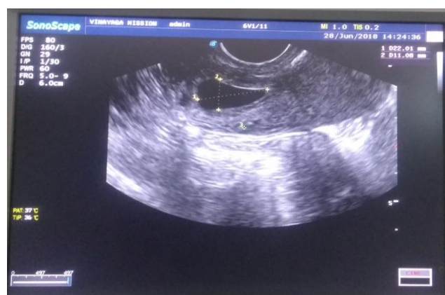
Fig. 1: Gestational sac in the lower anterior wall of the uterus suggesting scar pregnancy.