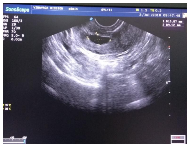
Fig. 2: Persistent scar pregnancy with little decrease in size after 2 doses of MTX on day 10.