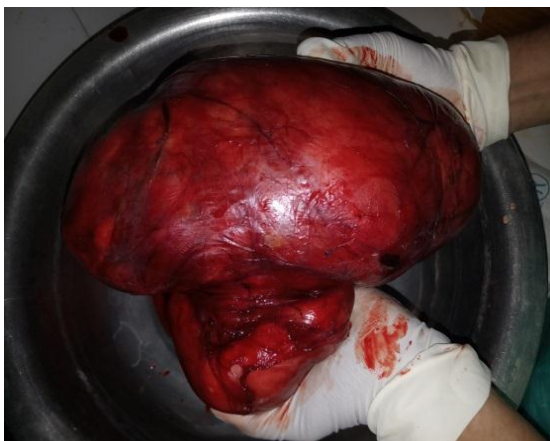
Fig. 2: Pseudo Broad ligament Fibroid specimen