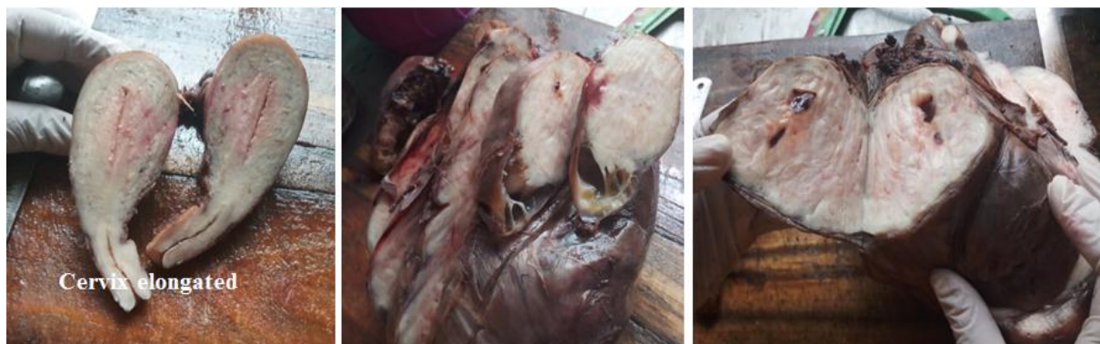
Fig 3: Cut sections of Uterus and fibroid specimens showing cystic degenerations and hemorrhages

Broad ligament fibroids are of two types either a uterine tumor which grows into the broad ligament known as false broad ligament tumor but it preserve uterine attachments. Or a primary also known as true broad ligament leiomyoma arising from the sub peritoneal connective tissue of ligaments. 1 True broad ligament tumors lie lateral to ureter and uterine vessels. Whereas false tumor always lies medial to it. 1 In our case fibroid arise from lateral wall of uterus on left side and it occupied almost entire pelvis and altered uterus position so it is a false broad ligament fibroid. Based on location of the fibroid patient presents with varies symptoms. In our case patient presented with abdominal discomfort due to huge fibroid and menorrhagia. The differential diagnosis for broad ligament leiomyoma includes benign or malignant ovarian masses, broad ligament cyst, lymphadenopathy and tubo-ovarian masses. 1 In our case on clinical examination and ultrasonography it was suspicious of an ovarian mass or broad ligament leiomyoma. Further CA 125 levels came as normal. According to rajanna et al, 5 case report, broad ligament fibroid may associated with pseudo meigs syndrome with elevated CA 125 levels hence MRI plays vital role in differentiation of broad ligament fibroids from ovarian tumors. In general broad ligament fibroids are single with regular borders. In our case it is large bossolated mass.