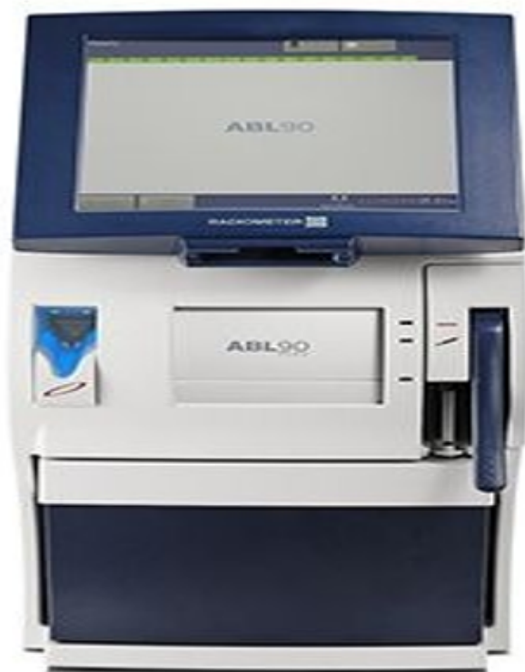
Fig. 2: Radiometer ABL 90 system 600