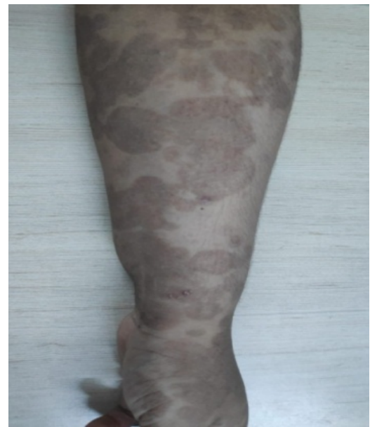
Fig. 6: After 2 months

Patient was admitted with preterm premature rupture of membranes at 33wks, progressed spontaneously and delivered a healthy male baby weighing 2.3Kgs. Postnatally baby was completely normal and patient continued to be on tapering doses of steroids and Azathioprine was stopped. Bullous pemphigoid Antibody was repeated which showed a declining trend. As the lesions were severe, postnatal recovery took 6 months.