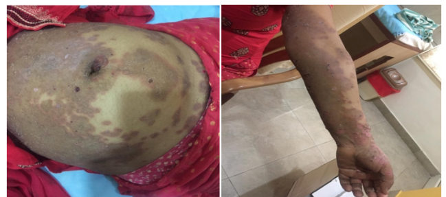
Fig. 1: Hive like rashes over abdomen & arms

fluid filled vesicobullous lesions for which dermatologist opinion was obtained.