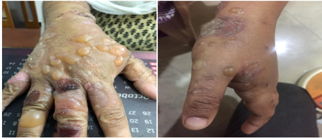
Fig. 2: Progressed to bullous lesions