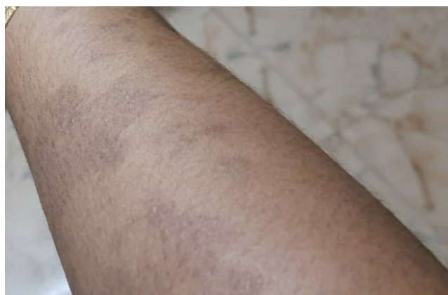
Fig. 7: After 6 months

producing autoimmune response and complement activation which further leads to deposition of immune complex and chemo attraction of eosinophil granulocytes, leading to tissue damage and blister formation. 4 This condition usually starts with intense itchy erythematous papules and plaques around umbilicus then spreads to abdomen, back, chest and extremities, sparing the face, mucosal membranes, palms and soles, later leading to blisters formation. 5 Symptoms in early stage resembles pruritic urticarial plaques and papules of pregnancy (PUPP) and Polymorphic Eruptions of Pregnancy (PEP) which lacks both blisters and autoimmune response thus differing from pemphigoid gestationis. 6