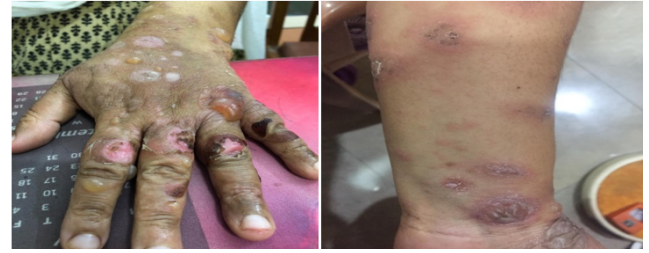
Fig. 5: Healing lesions