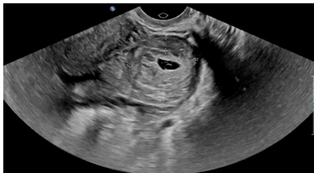
Fig. 4: Shows a well-defined round heterogenous lesion with central anechoic gestational sac and yolk sac like structure in left adnexa

sac and yolk sac like structure in left adnexa which was well defined. The lesion showed increased surrounding vascularity giving a ring of fire appearance. Left ovary was not separately visualized (Figure 4).