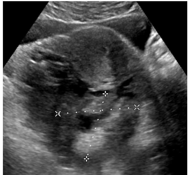
Fig. 2: USG grey scale images of pelvis show uterus is normal, endometrium measured ~ 8 mm. No evidence of sac/ decidual reaction in the endometrium. Right adnexa showed large irregular heterogenous lesion ~ 10.1 x 9.3 x 8.2 (410 cc) with internal anechoic cystic areas extending to pouch of douglas (POD).

A 29-year-old, with Copper T insitu came with complains of pain abdomen since 1 day, sudden in onset with history 4 episodes of vomiting. Clinically her vitals were stable. Her systemic examination was within normal limits. Her last menstrual cycle was 1 month back, with positive urine pregnancy test. On ultrasound abdomen, her uterus had copper T insitu, with collection in POD of about 170ml, likely clots, with right ovary visualized