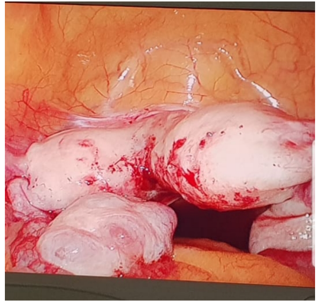
Fig. 2: Laparoscopic view showing bicornuate uterus with two separate horns and tubes

Laproscopy for the treatment of Bicornuate uterus is a safe option. Initially it was used for diagnostic purpose only but in the hands of skilled surgeons it is considered an alternative to abdominal Strassman metroplasty. The key advantage of laparoscopic procedure is less incidence of adhesion due to minimal tissue handling. 7 Adhesions are further minimized by use of liquid agents like 4% Icodextrin solution or spraying with hydrogel barriers. 8 However, good suturing skills are required for ensuring complete hemostasis in laproscopy. Adequate care may be taken to ensure that the myometrial edges are not sutured under tension, as it is prone for hematoma formation. It also increases the chances of necrosis formation in the uterine