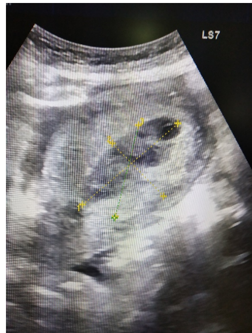
Fig. 1: TAS showing mixed echogenicity in the uterine cavity

Menarche usually occurs after 2-3 years of thelarche and 98% attain menarche by 15 years of age. 1 The normal flow at first menstrual period lasts for 7 days and 3 to 6 pads are soaked per day. Menstrual flow requiring change of pad every 1-2 hours or lasting for more than 7 days is considered abnormal. 2 The current girl attained menarche at average expected age (13 years) but at the onset of menarche her flow lasted for more than 2 weeks and was soaking more than 8 pads per day. It is important for clinicians to understand diseases that can manifest at the time of menarche so as to educate adolescents and their parents to differentiate normal from abnormal onset of menarche, menstrual abnormalities, diseases that may manifest at menarche that may have long term implications in adult hood. 3 The consensus on menstruation in girls and adolescents defines the normal menstruation and considers menstrual flow lasting for more than 7 days and amount