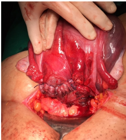
Fig. 2: Repaired uterine incision and rent

But at 36+5 weeks, she presented in labor and was admitted to hospital with mild contractions. Her vitals were stable and an admission test documented a baseline fetal heart rate of 136-140 bpm, baseline variability of 8-10 bpm with 5 accelerations in 20 minutes and no decelerations.