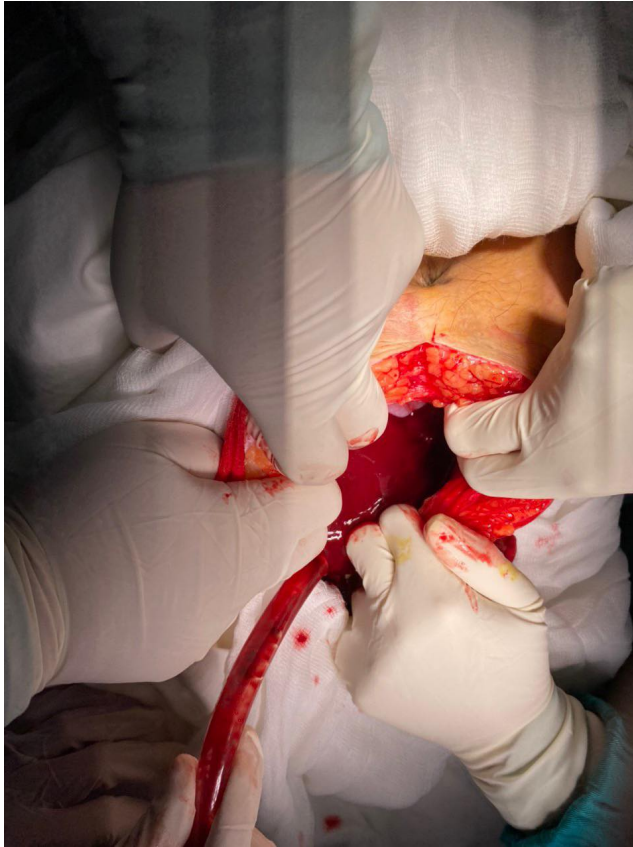
Fig. 1: Hemoperitoneum of dark color blood and blood clots were found in the abdominal cavity