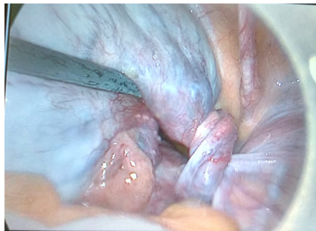
Fig. 1: Per-operative finding twisted right ovarian pedicle, preserved ovarian colour

Adnexal torsion is when the ovary, with or without the fallopian tube rotates along its vascular pedicle, leading to partial or complete occlusion of the blood supply and if left untreated resulting in necrosis. It has a propensity to involve the right adnexa. The left adnexa is probably spared due to the presence of the sigmoid colon which restricts its mobility, however bilateral torsions are also reported. 1,2 Ovarian torsion is a one of the gynaecological emergency requiring immediate intervention. The incidence