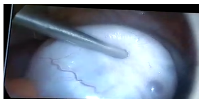
Fig. 2: Aspiration from the cyst to debulk the ovary