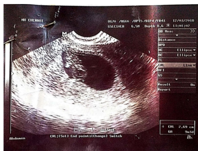
Fig. 3: Post op image of the live intra uterine pregnancy