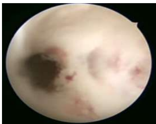
Fig. 2: Right ostium occluded by adhesions