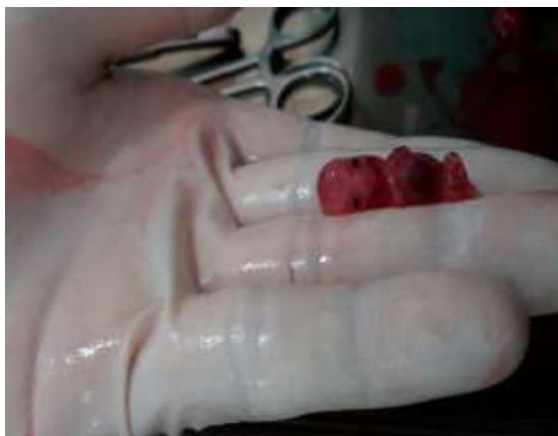
Fig. 2: Embryo extracted from peritoneal cavity