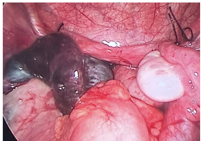
Figure 3: Laparoscopic view showing bilateral Oophoropexy