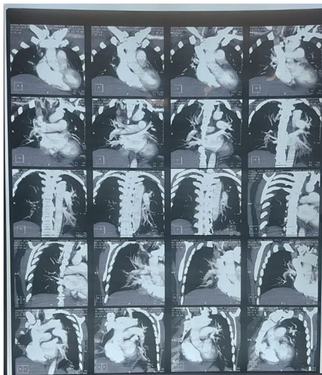
Figure 2: Computed tomography pulmonary angiogram of the patient

Post-surgery, the vitals of the patients were found to be normal. The patient was mobilized early 8-10 hours after the surgery. Twelve hours after the surgery Enoxaparin 1mg/kg (60 mg) was given. On the 2nd day post-operation, the patient started complaining about difficulty in breathing and chest pain. Upon examination, her pulse rate was high (104 bpm) with Spo 2 - 95% at room air and BP - 110/70mmHg. Crepitations were noted on the left lower side of the respiratory system. Electrocardiogram (ECG) showed sinus tachycardia with non-specific ST and T-wave changes (ST-T). Repeated 2D echocardiogram showed dilation in the right atrium, right ventricle, and EF (60%). Immediately computed tomography pulmonary angiogram (CTPA) was done which (Fig. 2) revealed wedge-shaped opacities in both lower lobes with pulmonary thromboembolism affecting both main pulmonary arteries and branching into segmental and subsegmental arteries. Acute PE was diagnosed, which is a life-threatening condition that occurs when a blood clot travels to the lungs and obstructs blood flow.