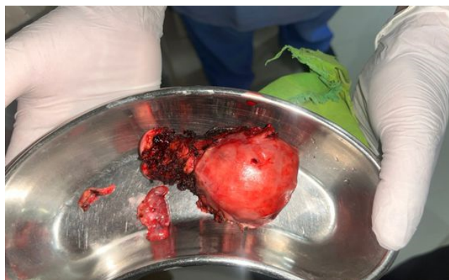
Figure 1: Patient's uterus after total laparoscopic hysterectomy with bilateral salpingectomy

Upon examination, her vitals were found to be normal. Systemic examination and blood examination were within normal limits. Based on the results of Echocardiography, chambers were found to be normal and the ejection fraction (EF) was reported to be 60%. After the assessment of physical fitness, a pre-anesthesia check (PAC) was performed. The patient received an American Society of Anesthesiologists (ASA) score of 2. Subsequently, the patient underwent TLH (Fig. 1) and bilateral salpingectomy under GA.