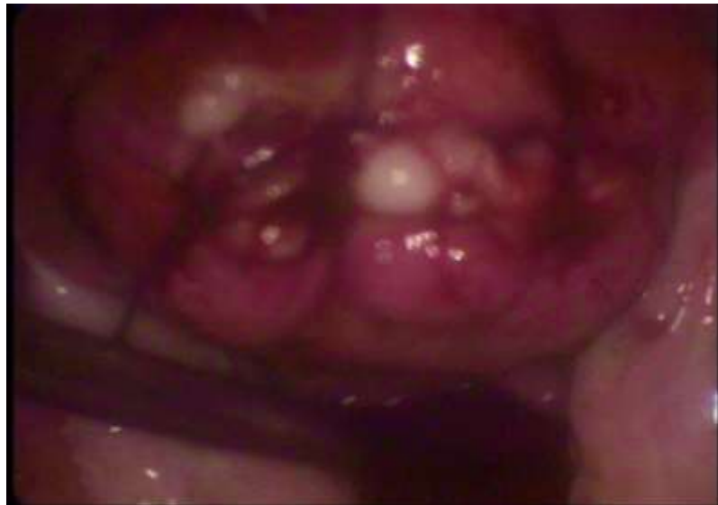
Fig. 2: Image showing the suture line after myoma bed closure with barbed suture