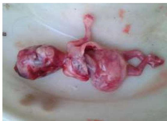
Fig. 1: Aborted foetus of ICM