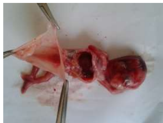
Fig. 2: Dissected view of ICM

Isolated congenital Megacystitis (ICM) is an extremely rare condition of unclear etiology. Postulated pathologic mechanisms include a visceral myopathy (1) and a mild variant of Megacystitis-microcolon-intestinal hypoperistalsis syndrome (MMIHS). (2) Since the condition is rare the optimal strategy for management is not clear and less, with previous authors reporting reduction cystoplasty (3) and clean intermittent catheterization (CIC) (2,4) as two options. Here, we report a case of ICM that is terminated after routine anomaly scan.