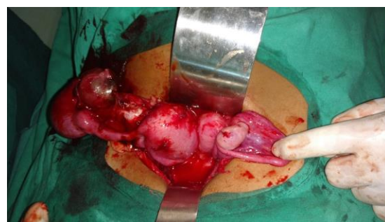
Fig. 2: Intraoperative photograph demonstrating right sided hematosalpinx, right ovary (normal) and distended right uterine horn. The left uterine horn, ovary and fallopian tube are normal