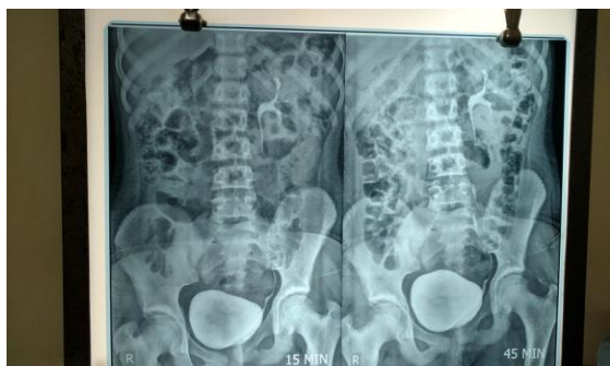
Fig. 5: IVP image showing absence of right kidney and ureter