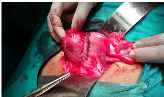
Fig. 3: Right sided salpingectomy followed by unification of both the uterine horns. The left fallopian tube and ovary are seen normal