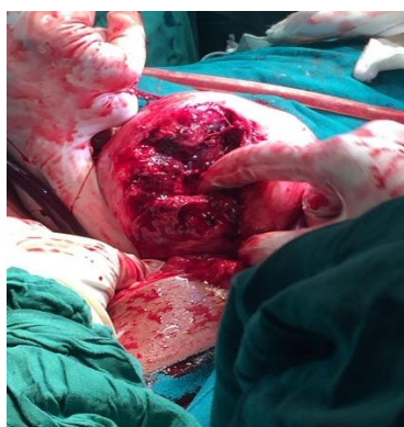
Fig. 2: Intraoperative picture showing irregular rupture of posterior uterine wall