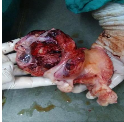
Fig. 2: Ruptured bicornuate uterus from right fundal area