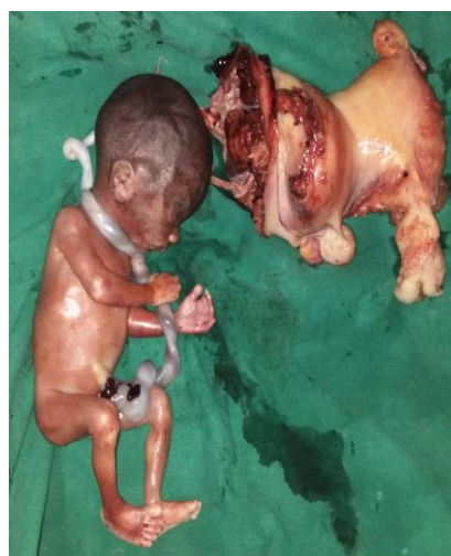
Fig. 1: Dead fetus with cord around neck with rupture uterus

possible Obstetrics hysterectomy with bilateral Salphingo-Oophorectomy done by clamping, cutting and ligating the supports of uterus. Total 10 clamps were taken in trolley. Bladder was separated from one side of round ligament to another round ligament at uterovascular fold to lower border of cervix. Window was created at avascular area in broad ligament near infundibulum. First clamp at infundibulo-pelvic ligament then uterine artery clamped doubly at isthmus at 45 degree. Next clamp applied parallel to uterus in mackenrodt's ligament, Next clamp at level of utero-sacral ligament. Last clamp at the level of cervix and cut and clamp and uterus was taken out of abdominal cavity. All clamps applied bilateral and sutured by transfixation doubly one by one. She received one intra-operative and four post-operative blood transfusion. Injection calcium gluconate 10ml in 100ml of normal saline was given after 3 rd blood transfusion. Except Hb - 4.9 gm %, rest routine blood and urine reports were within normal limits. Her post op period was uneventful.