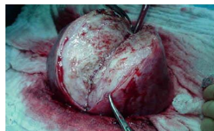
Fig. 1: Cut specimen of uterus showing myohyperplasia and adenomyosis

It is relatively frequent in multiparous women, in their fourth and fifth decade of life. 5 Risk factors for adenomyosis are age, multiparity, surgical disruption of the endometrial-myometrial border, elevated levels of both FSH and prolactin, smoking habits and history of depression. 6,7 Clinical diagnosis of adenomyosis is challenging because symptoms closely mimic those of other uterine pathology such as fibroid uterus, endometriosis or endometrial polyps. 8,9