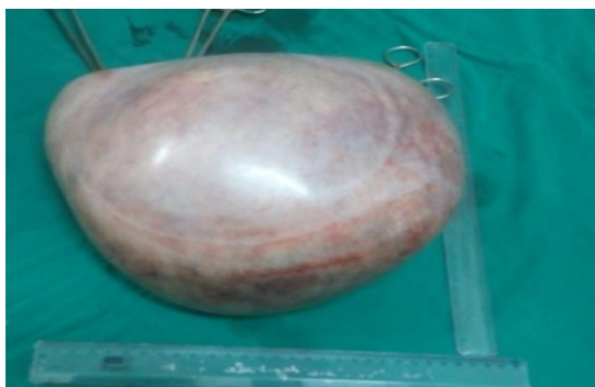
Fig. 1: Gross appearance of the tumour

layers) and forming architectural complex pattern with branching and tufting. The lining epithelial cells were endocervical type and exhibits moderate degree of cytological atypia, foci of malignant nuclei, prominent nucleoli and increased atypical necrosis and destructive stromal invasion upto 3 mm (Fig. 2 & 3). The final impression was "Borderline mucinous tumor of ovary-endocervical type – intraepithelial carcinoma". Peritoneal fluid cytology and omental biopsy was negative for malignancy. Her postoperative period was uneventful. With the final diagnosis of borderline mucinous tumor of right ovary stage Ia, she was discharged on eighth post-operative day and was advised follow up. Patient is on regular follow up.