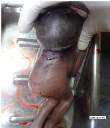
Fig. 2: Meningomyelocele