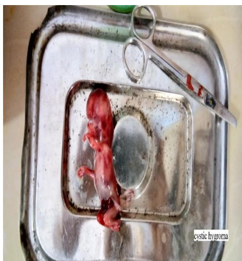
Fig. 3: Cystic hygroma