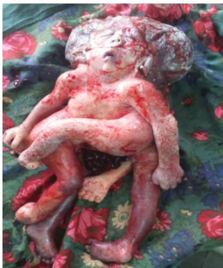
Fig. 1: Delivered cephalothoracophagus conjoined twins

On examination her vitals were – Pulse 120 beats per minute with blood pressure 90/50 mm hg with respiratory rate of 14 per minute with cold extremities. she appeared to be in hypovolemic shock.