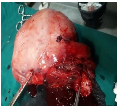
Fig. 4: The specimen after obstetric hysterectomy

Pedicles checked for hemostasis. Closure was done of abdomen in layers. Vaginal toileting done. (Fig. 4)