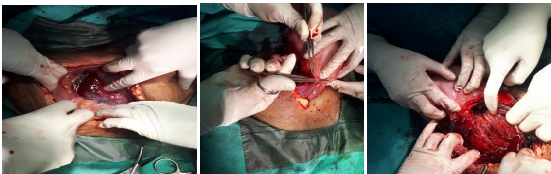
Fig. 2: Right sided broad ligament haematoma and right side colporrhexis

Immediately, the patient was shifted to the operation theatre for exploration under general anaesthesia. Adequate products of packed cell volume and platelet products were arranged. Under adequate light exposure and general anaesthesia in the lithotomy position, tear was found to extend in right vagina, fornix, cervix and lower uterine segment. Therefore general anaesthesia was administered for an explorative laprotomy. Proper aseptic precautions were maintained and a midline sub umbilical incision was made over the abdomen. Abdomen was opened in layers. Once the peritoneum was opened - a huge right side broad ligament haematoma extending from round ligament until cornua to upper one third of vagina was found of approximately 8* 7 cm size with right colporrhexis. (Fig. 2)