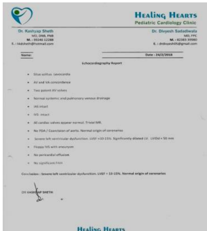
Fig. 2: Postnat echo findings