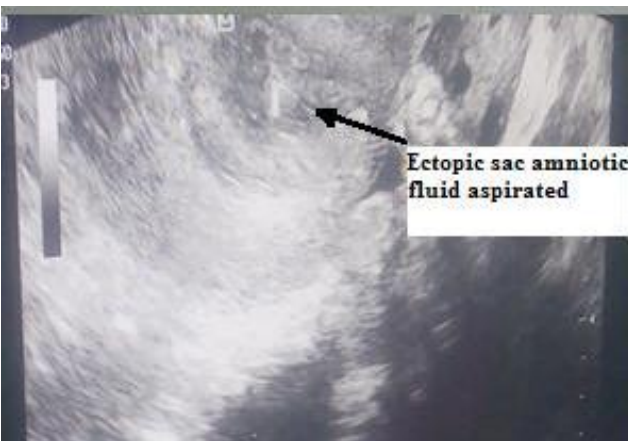
Fig. 3: Aspiration of amniotic fluid