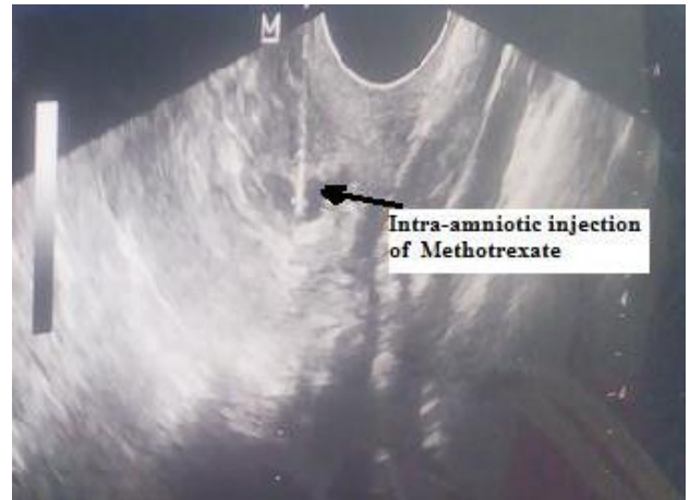
Fig. 4: Instillation of local methotrexate